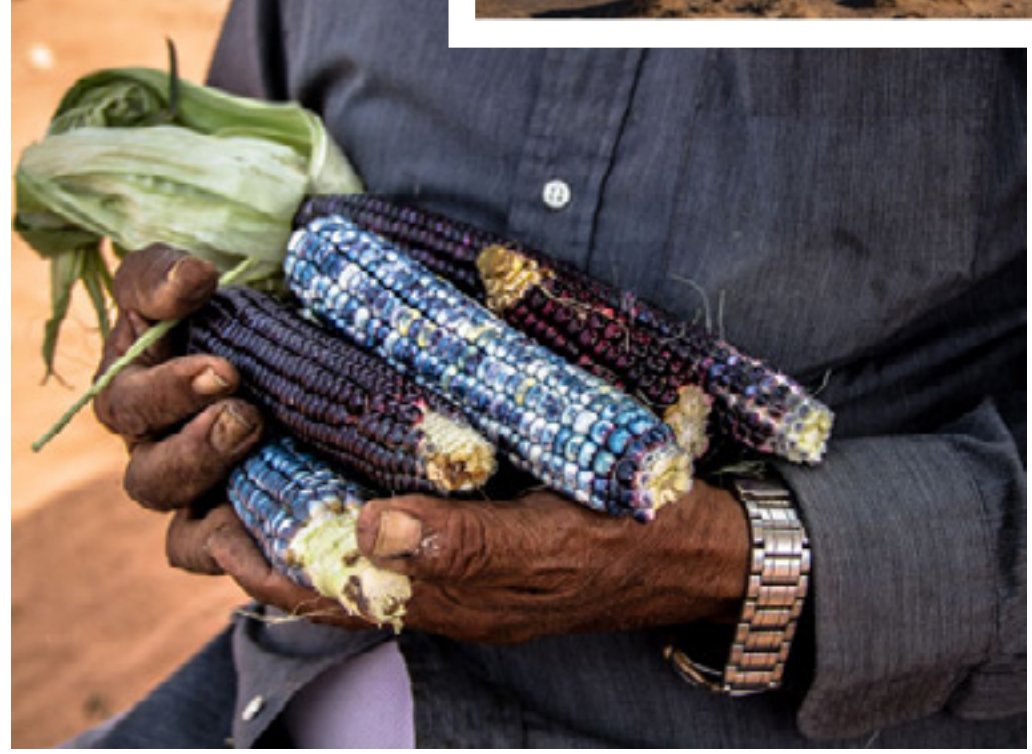
Figure 3: Navajo corn grower holding blue, turquoise, red, purple, Prussian blue corn (https://www.motherearthgardener. com/plant-profiles/blue-corn-and-corncolors-zmaz15wzsbak)