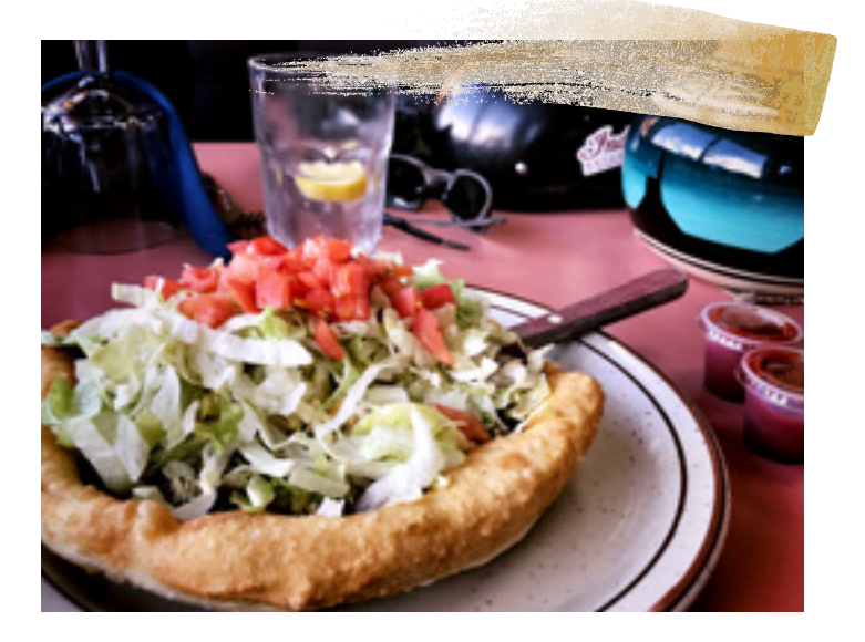
Figure 4: https://eatingtheworld.net/2016/03/09/navajo-tacos/

One controversial debate in food sovereignty is that many tribes have adopted traditional foods, such as the very famous frybread which is a staple to a Native diet just like the tortilla is to a Latin diet. Frybread, especially in the form of Indian tacos, can be found at any gathering or local restaurant in many states with higher Native populations. However, this comfort food also brings with it a heated debate over food sovereignty. In simple terms, frybread is made from wheat flour and typically fried in lard or oil. Wheat is an ingredient brought to the United States by way of European settlers; thus, it is not a traditional food source. Further controversy is that the origin of frybread is the historically traumatic story of the Navajo Long