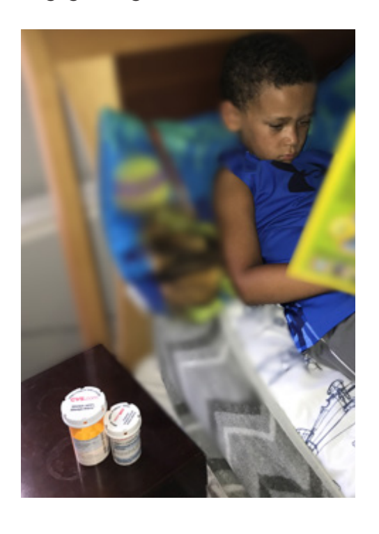
Engage Image #1