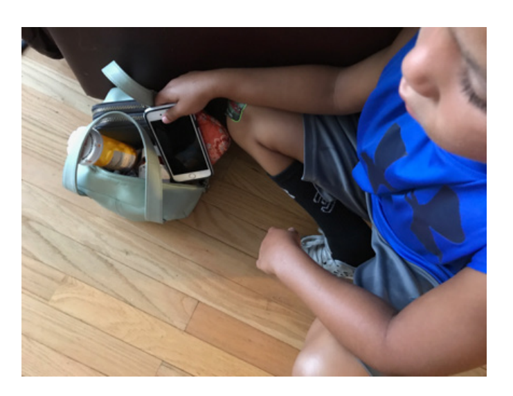
Engage Image #2