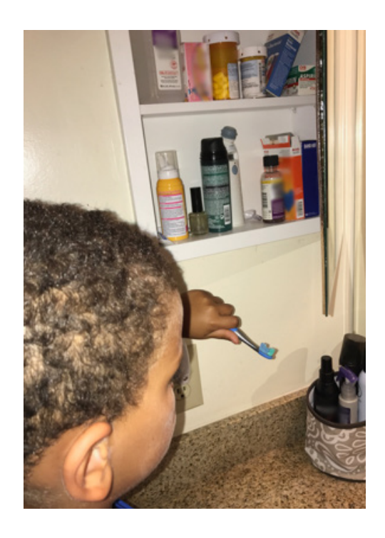
Engage Image #3